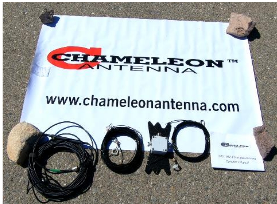
Figure 5 - EMCOMM III components