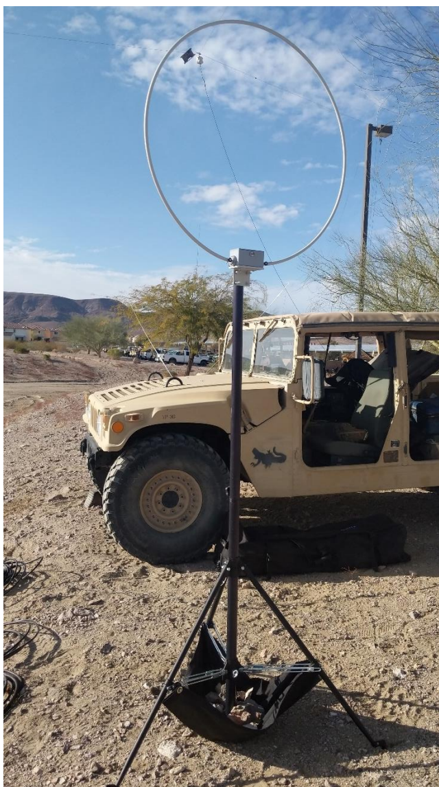
Figure 8 - Receive Loop (RXL) tripod mounted