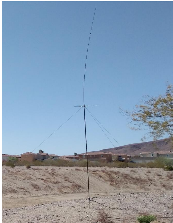
Figure 9 - Chameleon MPAS 2.0 with capacity hat in vertical configuration

This is a broadband antenna that requires a tuner for most frequencies.