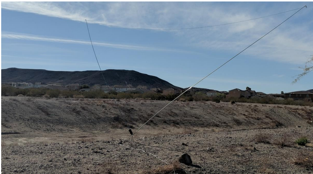
Figure 7 - Tactical Delta Loop ground spike mounted

This antenna is broadbanded, and requires a tuner