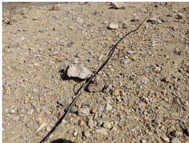
Figure 4 - Damage done to TD 2.0 counterpoise wire

Later on in the exercise, I attempted to install the TD 2.0 as a horizontal dipole, a setup not recommended for the RF-1944 and confirmed to be awful by my attempt last year. In doing so, I managed to violate a basic rule of horizontal dipole mounting, don't raise it by the antenna. It was too long to string horizontally between the two street lamps so I pulled the wire of the counterpoises across the lamp posts. This caused cuts to the counterpoises and completely split one open. To the TD's credit, the SWR remained just as flat as before, with or without the exposed wire of the damaged counterpoise.