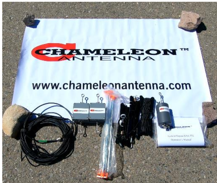
Figure 3 - Tactical Dipole 2.0 (TD 2.0) components

The TD 2.0 is very, very broadbanded and on many frequencies I used required no tuner.