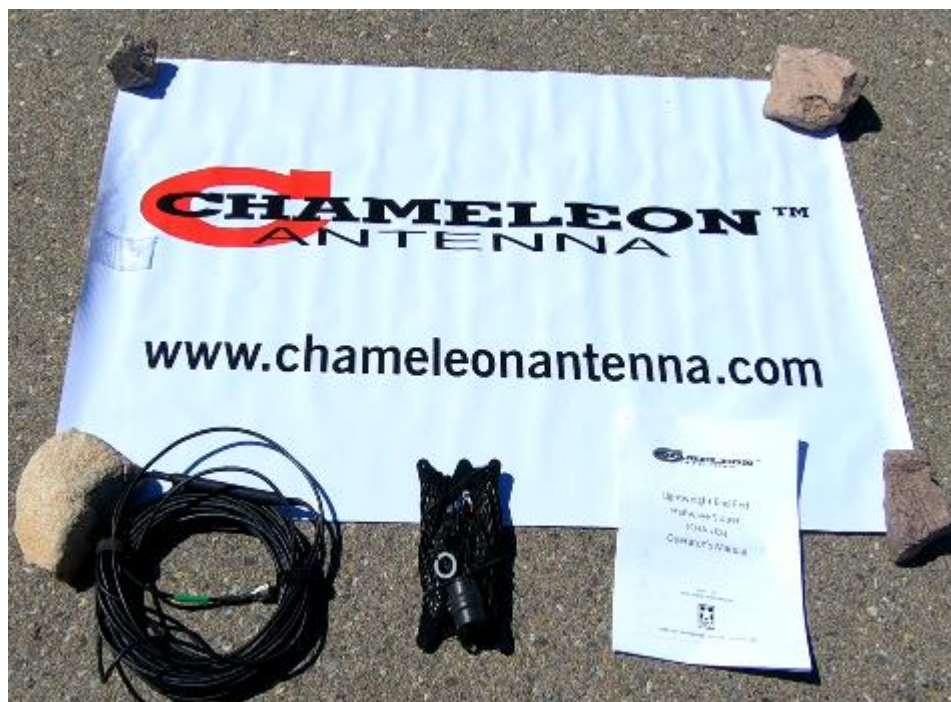
Figure 6 - Lightweight End-Fed Sloper (LEFS) layout

This antenna is resonant on all advertised frequencies for amateur use, and doesn't require a tuner.